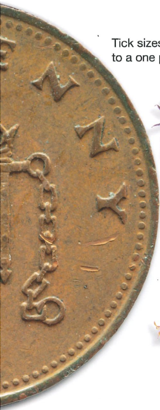
Tick sizes compared to a one penny coin