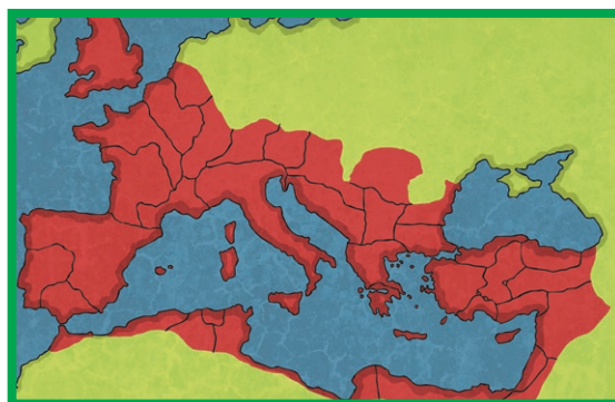
The Roman Empire in AD 117

The Romans were a group of people who were named after this important city. However, many soldiers fighting in the Roman army did not come from Rome itself. Instead, they originally came from one of the many countries which formed part of the Roman Empire.