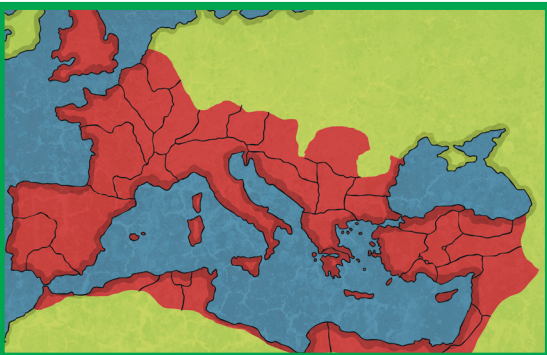
The Roman Empire in AD 117

The Romans were a group of people who were named after the important city of Rome. However, many soldiers fighting in the Roman army did not come from Rome itself. Instead, they came from one of the many countries which were part of the Roman Empire.