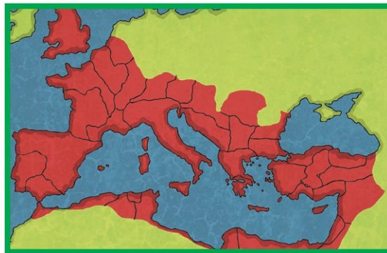
The Roman Empire in AD 117

However, many soldiers fighting in the Roman army did not come from Rome itself. Instead, they came from one of the many countries which were part of the Roman Empire. The Roman Empire included parts of Europe, North Africa and the Middle East.